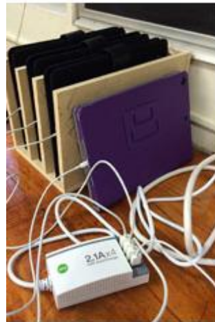
1, Sandburg Middle School, Elmhurst, IL